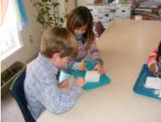
Explorer paleontologists are busy digging!