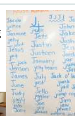
Jj word list