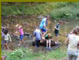
Falls Mill 2008